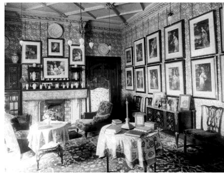
Interior Ryecroft Hall around the time Austin lived there